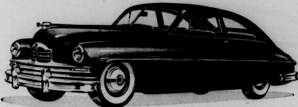
The 135-HP Packard Eight Club Sedan

Yes, we mean 19 miles per gallon . . . from a husky, 135-HP Eight! Thrifty Packard owners are doing it every day—the chart at right tells the story . . .