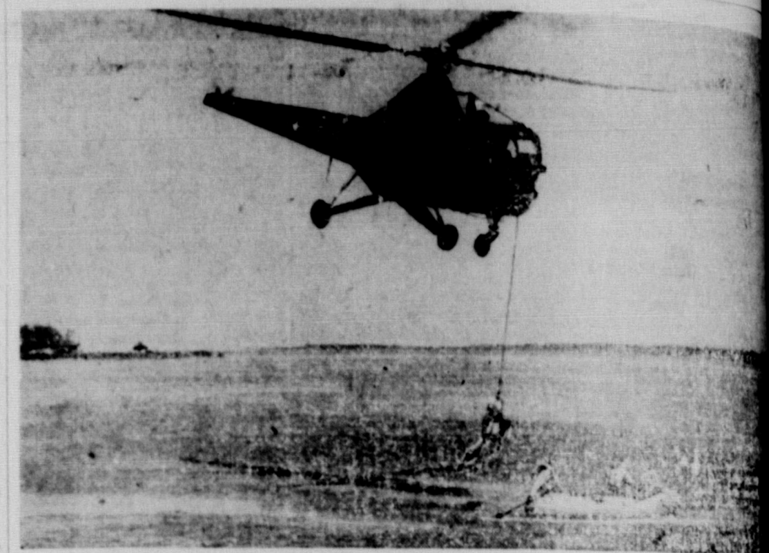
MARINES GET THE SWING OF IT... This sort of thing might be all right for circus acrobats and people lost at sea in life rafts, but it is not recommended as a diversion for the average man who likes to have his pipe and slippers brought to him in the evening. This particular maneuver was carried out by marines at Quantico, Va., in a demonstration of the airtide carry air-sea rescue technique. Hazardous though it may look, ascending from a life raft into a helicopter is still better than staying on the raft. Further demonstrations of air-sea rescues were held in connection with the 36th anniversary of the marine corps aviation section.