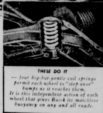
THESE DO IT — four big-but-gentle coil springs permit each wheel to "step over" bumps as it reaches them. It is this independent action of each wheel that gives Buick its matchless buoyancy on any and all roads.

possible for each wheel to step over bumps as they came along, leaving the frame and body to pursue their level way undisturbed.