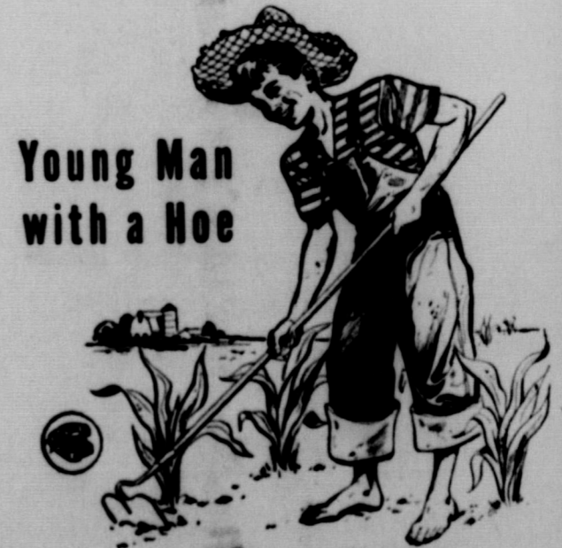
Young Man with a Hoe