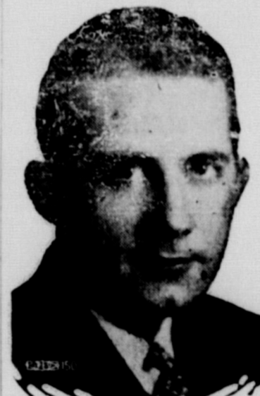
ALLAN SHIVERS of Jefferson County

Senator Allan Shivers is basing his appeal for promotion to lieutenant governor on service to his state and his country. Dean of the Texas Senate, he is rated one of the ablest and most active members of the legislature and, on his record alone, is entitled to be promoted to the rank of presiding officer of the Senate. He spent two years overseas as a soldier in World War II. (Political Advertisement)