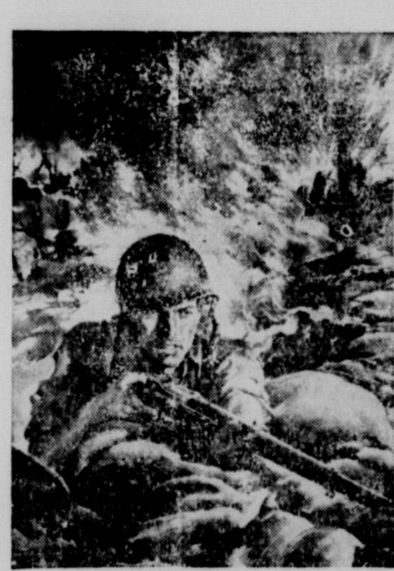
... Ask the Joes in the front lines!'