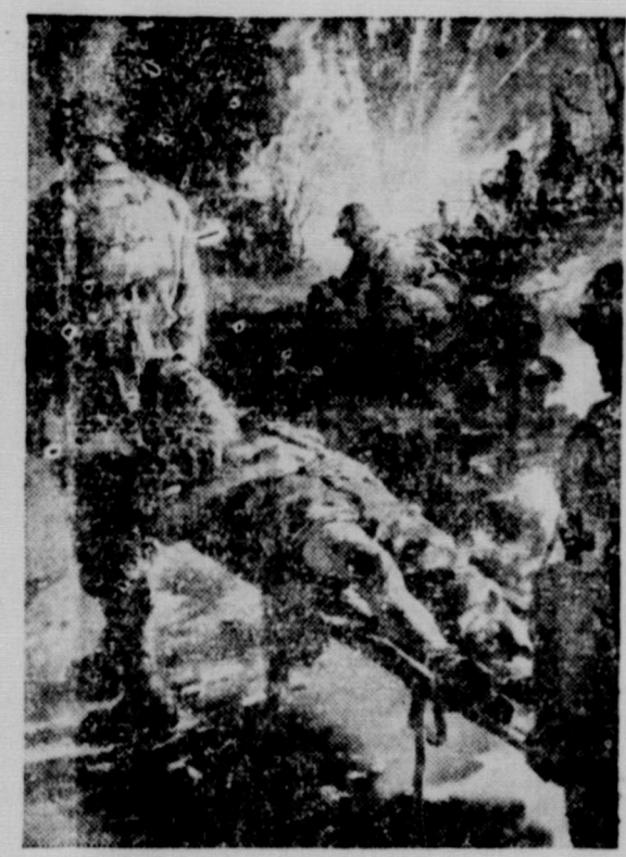
Ask that kid on the stretcher!"