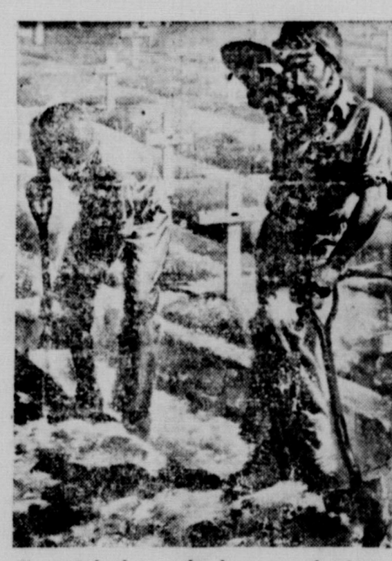
"... Ask those who bury our dead!"

"THEY KNOW. Every G. I. Joe knows. I "This is the big show. This is the pay-off. This is the one that counts.