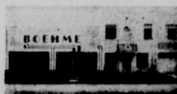
Our New Plant, Built in 1941