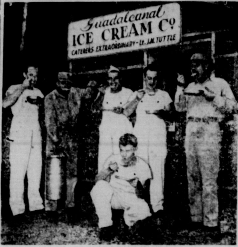
Destined for the scrap heap because many of its parts were worn out and could not be replaced, an ice cream manufacturing unit of Guadalcanal was salvaged and put in order by a naval construction battalion and now is turning out ice cream twice a week for Seabees and the marine unit to which they are attached.

sweater, two pairs socks, one light undershirt, one pair light drawers, six cakes of toilet soap, two bars of laundry soap, one tin tooth powder, tooth brush, clothes brush, hair brush, shoe brush, one pocket comb and cover, one jar brushless shaving cream, two bath towels, two face towels, one tin shoe polish, four handkerchiefs, two pairs, shoe laces, one "housewife" (including needles, thread, buttons, safety pins, pins and darning cotton), one box cascara, one box vitamin tablets, one box band-aids, one pipe and pipe cleaners, three packages smoking tobacco, one carton cigarettes, and one carton of chewing gum.