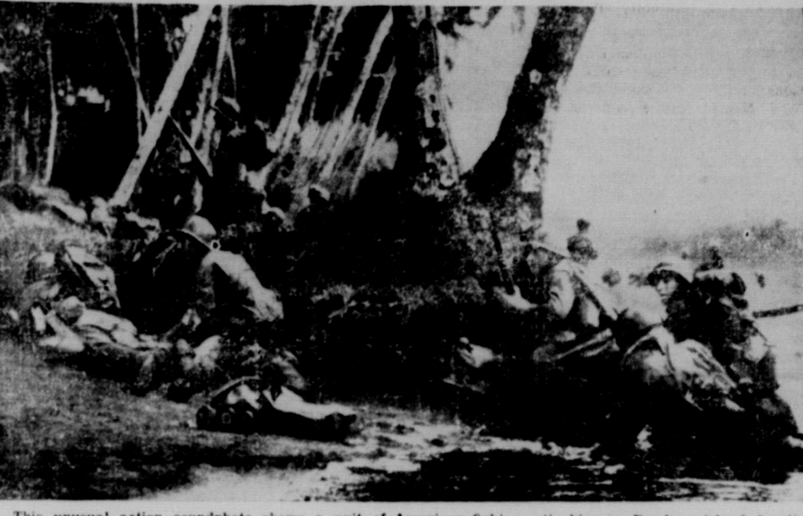
This unusual action soundphoto shows a unit of American fighters attacking on Rendova island despite a heavy downpour. In the dim light of dawn they huddle against tree trunks and other cover. Intensification of the war against Japan on other fronts was indicated by the establishment of an Allied Southeast Asia command under Vice Admiral Lord Louis Mountbatten of Britain.