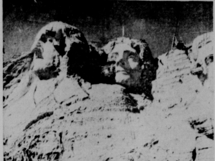
The heads and shoulders of President Washington and President Jefferson, sculptured in the solid granite of South Dakota's Black Hills, receive the finishing touches as workmen begin work on the last figure, that of President Lincoln. Gutzon Borglum, the sculptor, recently announced that he expected to have the major work on Mount Rushmore, near Rapid City, completed by next year, leaving the finishing touches for 1939.

Q. On the Southern Pacific Railroad between Alpine and Marfa, the highest point along the line between the Gulf of Mexico and the Pacific Ocean.