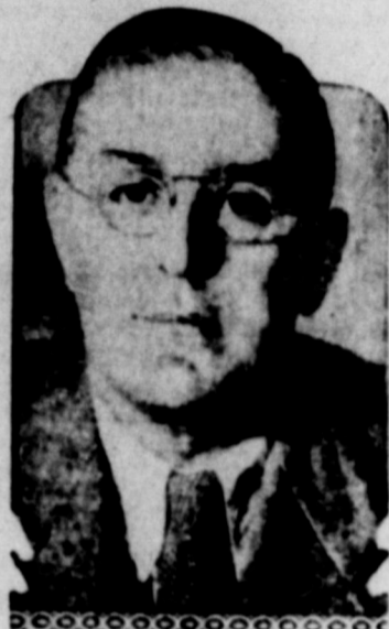
Joseph L. Breen, who has been made director of the production code for motion picture producers and distributors, is relied upon to keep the pictures decent.