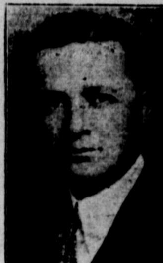
JAMES V. ALLRED

One of the two men pictured above will be the next governor of Texas, depending on the verdict of the voters at the polls next Saturday in the run-off primary. Both Hunter and Allred have conducted vigorous campaigns for the highest office in the state and interest is great over the state in the outcome of the battle.