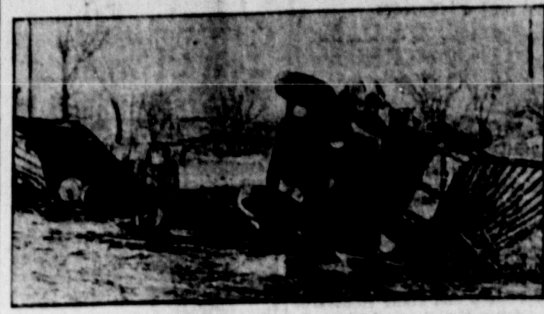
Five children were killed and 20 injured when a bus and truck collided M Rapid City, S. D. The picture shows a view of the wreck.