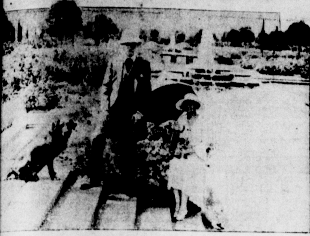
By special permission, this photograph shows the viceroy and vicereine of India, Lord and Lady Willingdon, in the beautiful gardens of their residence in New Delhi.