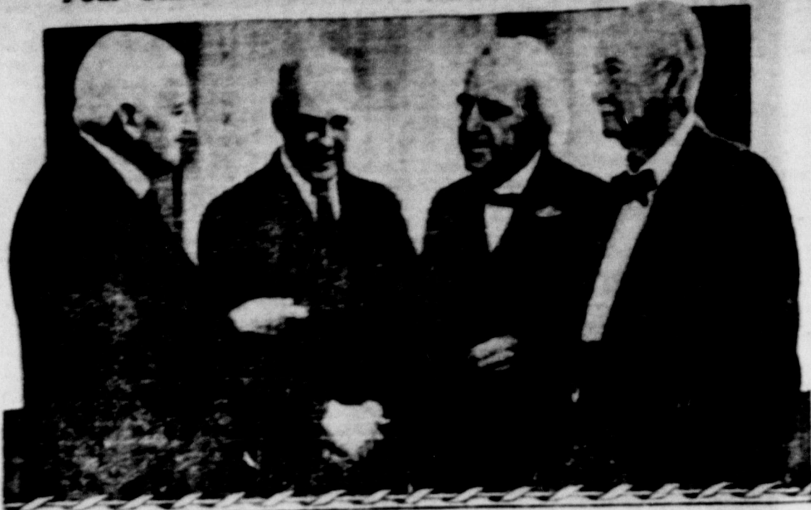
These four oldest members of the House of Representatives were photographed at a recent get-together in Washington. From left to right, they are: Nelson Morris of Connecticut, who is seventy-eight; Andrew Jackson Montague of Virginia, another eighty-year-old; Edgar Howard of Nebraska, seventy-five, who used to be William Jennings Bryan's secretary; and Clement Daniel Dickerson of Missouri, eighty-four years old.