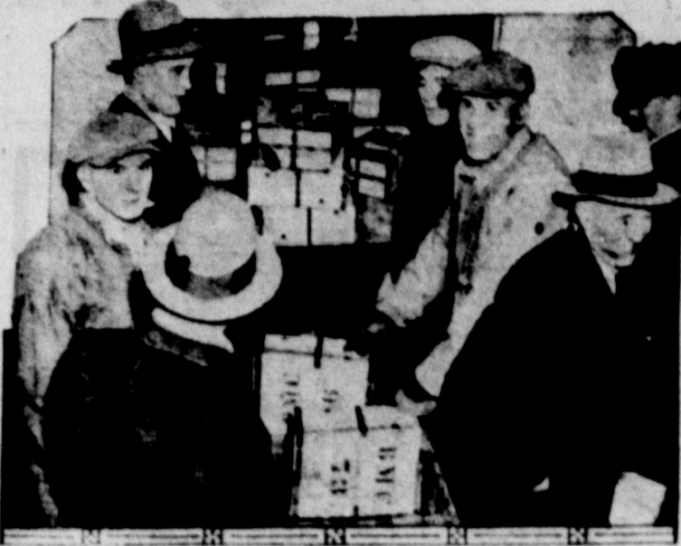
Police, detectives and private guards on a pier in New York while 224 cases of gold bars were being unloaded from the steamer Brensen. The value of this shipment from Europe was $12,000,000 in gold, and it went into government vaults.