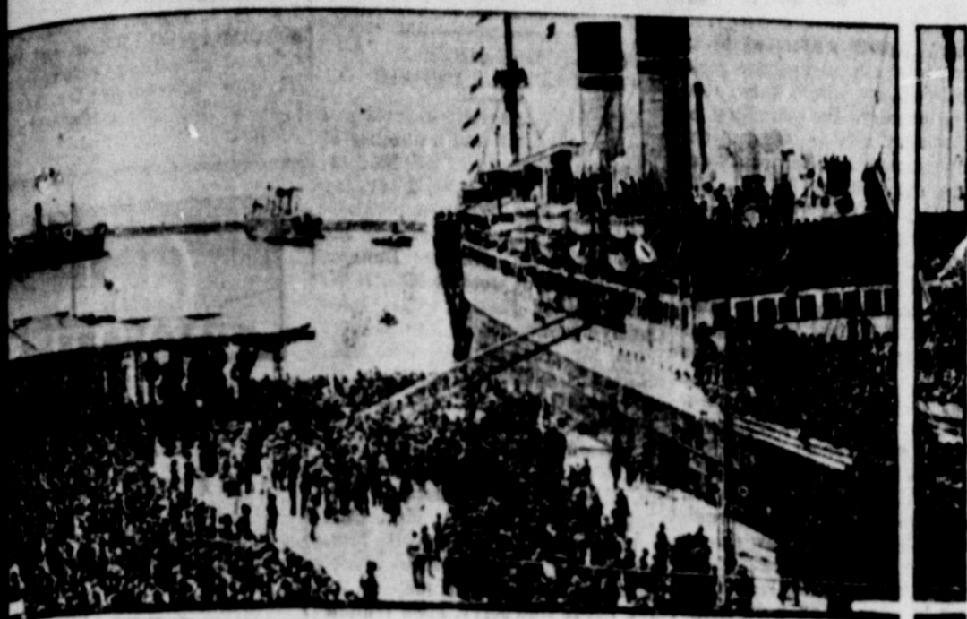
Members of the 20th Italian Infantry departing from Naples on a transport for the colonies in East Africa and to fight in the war against Ethiopia if that contest comes to a head.