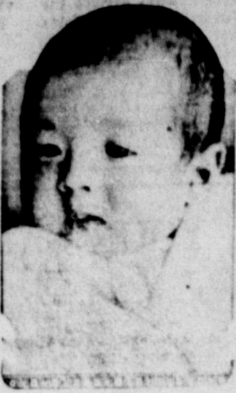
First photograph of the young Akiko, the royal baby, taken in the throne of Japan. Her name means "Wise and Successful Prince."