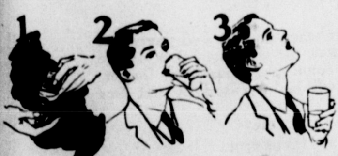
Take 2 Bayer Aspirin Tablets. Drink full glass of water. Repeat treatment in 2 hours. If throat is sore, crush and dissolve 3 Bayer Aspirin Tablets in a half glass of water and gargle according to directions on box.