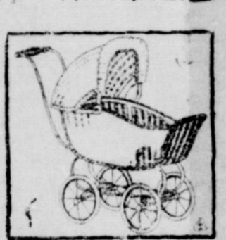
DOLL BUGGIES to fit any size doll