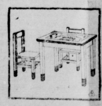
folding or stationary $1.80 up.