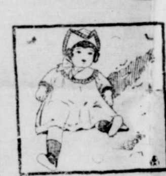
Genuine Madama Hendren Dolls They Walk, Talk and Sleep