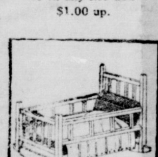
DOLL BEDS of all descriptions $3.15 up.