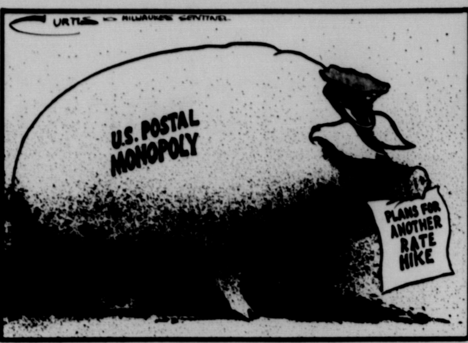
Can a pig stop grunting?