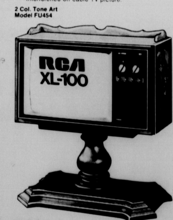
2 Col. Tone Art Model FU454 RCA The BRANDYBINE Model FU454 19" diagonal

Get glorious RCA XL-100 color in this full-featured table model.