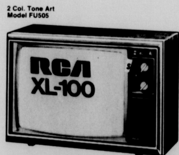
2 Col. Tone Art Model FU505 RCA The COSMOS Model FU505 21" diagonal

Here's big-screen RCA XL-100 color TV at a great price!