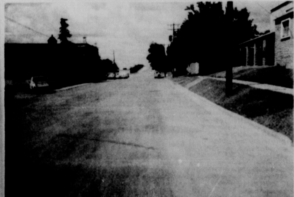
AN EMPTY STREET IS NOT USUALLY OF ANY CONSEQUENCE, however, when school is going on and that street is between the high school and junior high and the library and administration building, it is news in Ozona. The street has been cleared of parking this year and has been a great improvement in traffic safety around the school plant. The new parking lot across from the high school has been completed and is being used daily by students and faculty.