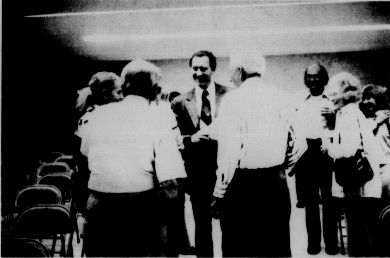
OUR CONGRESSMAN VISITS -- Bob Krueger, U. S. Congressman from the 21st District of Texas, spent a couple of hours in Ozona Monday at the Civic Center giving his views on government at the federal level and explaining his votes on various

issues. A question and answer period followed and those present managed a word with their representative during the reception before the program or the fellowship which followed.