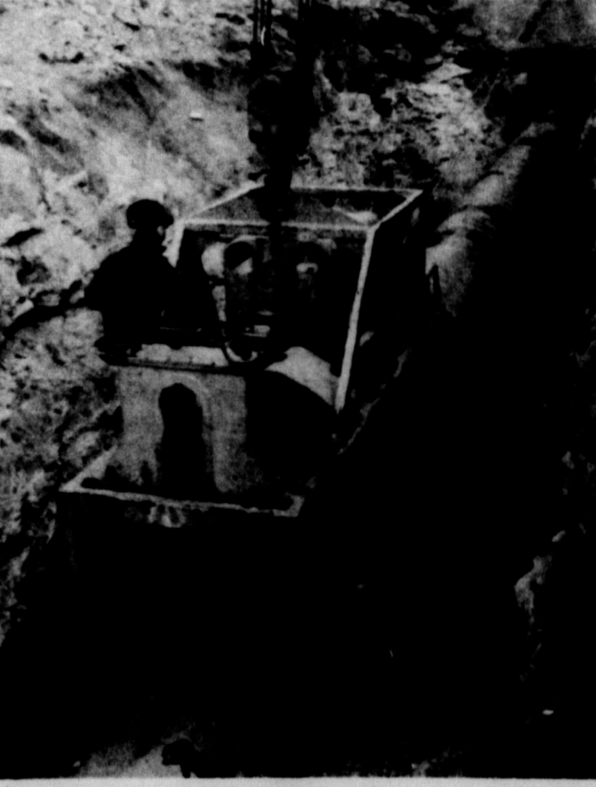
BIG MACHINES DO BIG WORK. AND this is one whale of a machine doing a tremendous job four miles south of Ozona last week. The machine pictured is driving a bit which is boring a hole through solid rock under State Highway 163 to carry the 36-inch pipeline being laid across this county by McVean and Barlow, contractors. The pipeline is part of the line being laid from New Braunfels to the Coynosa area north of Fort Stockton in Pecos County. The pipe following the auger is 42 inches in diameter and will remain under the road as a carrier for the 36-inch pipe. The machine augers the cuttings out of the hole (note cuttings beneath operator) and drives the pipe ahead as the hole is cut. The boring machine, held up by a winch line from a bulldozer parked on the side of the big ditch, drives the auger by gear wheels. The big driving gear may be seen beneath the machine. It took more than two days to drill the 100-foot plus tunnel under the highway.