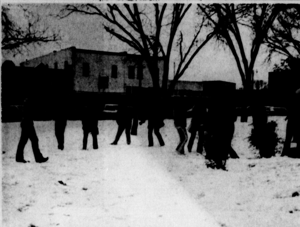
WINTER COMES TO OZONA and when school let out Monday the kids took full advantage of it. In spite of freezing weather, they gathered in the downtown park for an old-fashioned snowball fight. With several inches of snow on the ground, there was plenty of ammunition. Snow and freezing rain arrived in Ozona at mid-morning Monday and temperatures dropped to below freezing before dark. The mercury plunged to 16 degrees above zero before sunup Tuesday and temperatures warmed considerably under a bright sun.