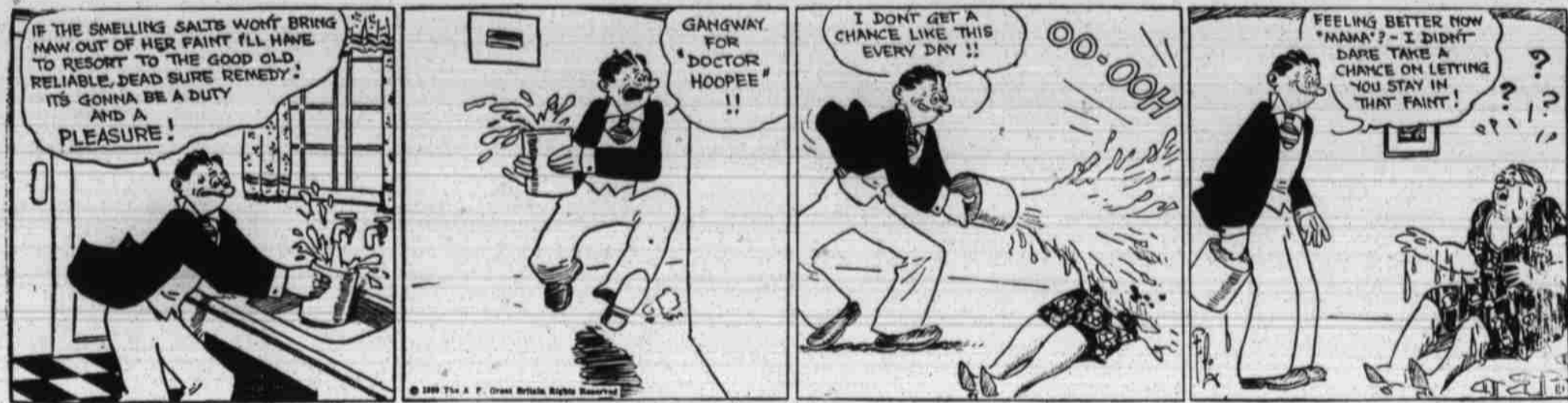
(This Is What He Was Doing December 3, 1930)

...and what will be the predicament of "Pa's Son-in-law" on Labor Day, 1931