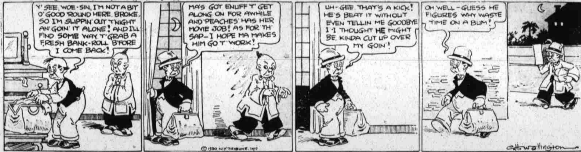
(This Is What He Was Doing December 3, 1930)

...or what will be "The Water Bucket" comment on the World Series?