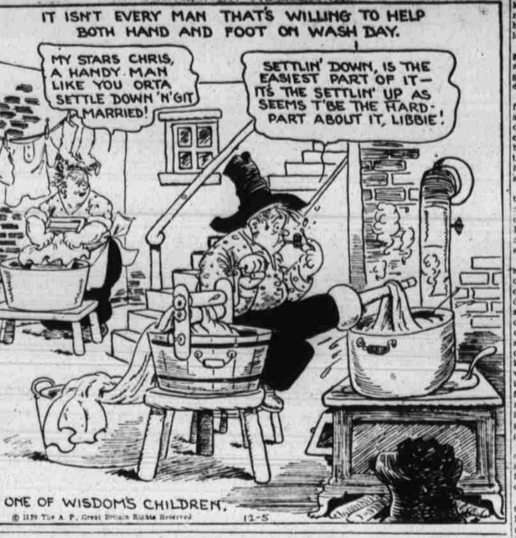
ONE OF WISDOMS CHILDREN.