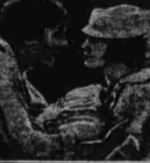
This is a view from D. W. Griffith's new masterpiece, "Abraham Lincoln," with Walter Huston in the title role. It will be shown Saturday evening at 11:30 o'clock at a special midnight matinee performance at the Ritz.

Today and tomorrow the Ritz is showing the hilarious new comedy hit, "Caught Short," based on the stock market crash and starring Polly Moran and Marie Dressler.