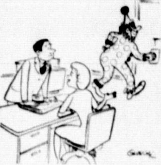
"Every office has one... and he's made a career of it--"