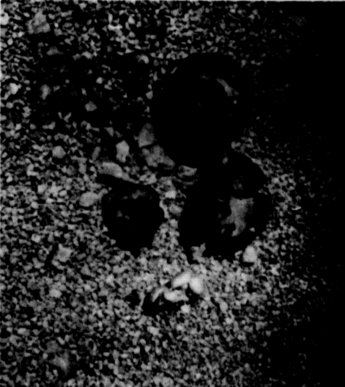
BROTHER, IT'S WET when toadstools pop up in the pavement. The picture looks straight down on a cluster of toadstools that jumped out of the pavement on the drive approaching the home of Mr. and Mrs. Tom Mitchell on Ozona's west hill. The big toadstool to the left is fully five inches across. Note the little round one left and the crumpled specimen at right.

The board surprised Armistead with a "going away" party and presented him with an engraved pocket knife.