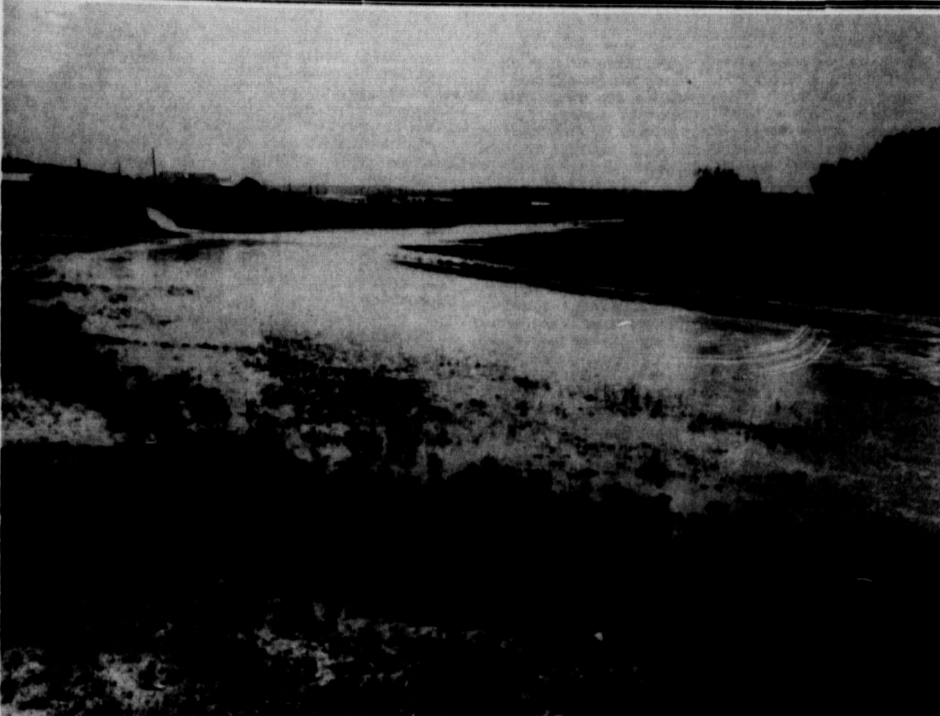
A RIVER RUNS THRU OZONA -- when it rains as much and as long as it has the last three or four weeks. This is channel-improved Johnson Draw south from the Highway 290 bridge as it looked two days after torrential rains to the north of Ozona on the Johnson Draw watershed filled a number of the flood control dams. The result is an orderly discharge of flood waters from retardation dams into the channel, the flow covering several days time, depending on how much and how many dams are filled.

kk eters this day and great pleasure in they are non-confor- at times I find it ed on last page)