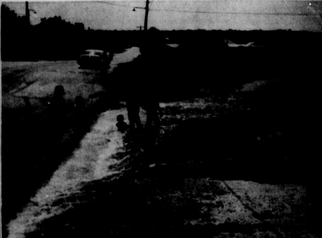
THEY'RE CATCHING FISH in Gurley Draw as clear water flows down the draw crossing the south-east section of Ozona. The draw has been running for more than a week from heavy rains which filled the lake behind the flood control dam on the W. E. Friend ranch. And those youngsters are catching small perch and big minnows in nets. Note the boy at right with his homemade dip net. Where the fish came from is anybody's guess.