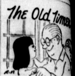
“One of the most interesting handclaps is that of a grandchild around the finger of grandparent.”

If Dr. says ulcers, Ph-5 tablets. Fast as lightning. Only 98c at Village Pharmacy.