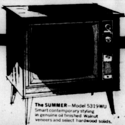
The SUMMER—Model 5319WU Smart contemporary styling in genuine oil finished Walnut veneers and select hardwood solids.

ZENITH PIONEERED COLOR TV ADVANCES IN ZENITH PERFECTED COLOR TV.