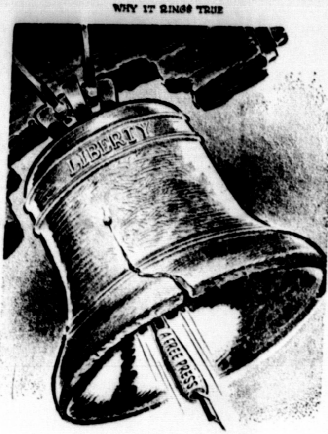
WHY IT RINGS TRUE

Always approach your still-fishing spot carefully and si-