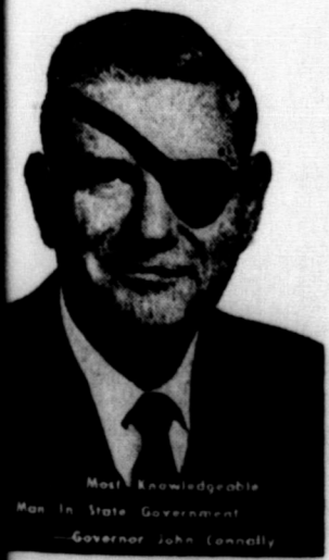
Man stands tall as THE qualified choice in the Attorney General's race. He is so obviously the best choice that more than 75 newspapers endorsed him over two young opponents.

VOTE MAY 7 FOR A VOICE OF EXPERIENCE AND INTEGRITY FOR TEXAS!