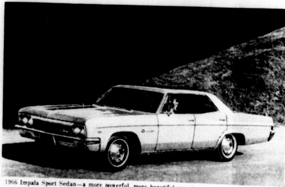
1966 Impala Sport Sedan—a more powerful, more beautiful car at a most pleasing price.

If you haven't examined a new Chevrolet since Telstar II, the twist or electric toothbrushes,