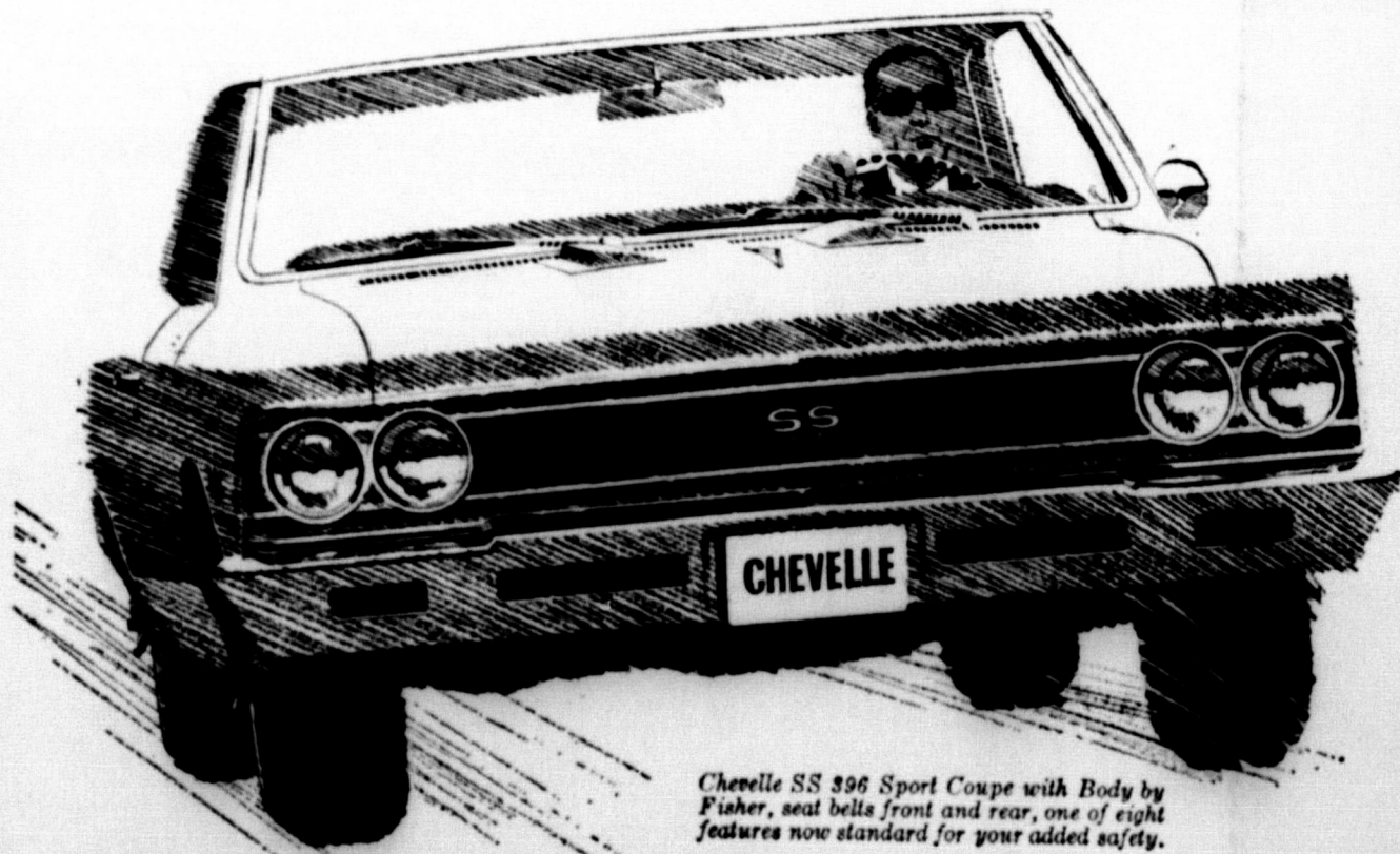
Chevelle SS 396 Sport Coupe with Body by Fisher, seat belts front and rear, one of eight features now standard for your added safety.

For the guy who'd rather drive than fly: Chevelle SS 396