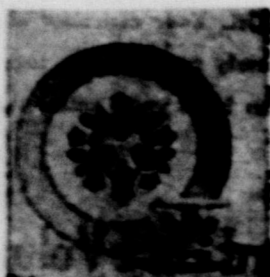
BLURBERRY PROVINCIAL Early American shapes with blue background, green leaves, lemon-yellow blossoms. 45-P. Set Open Stock $106.96 Special $74.50