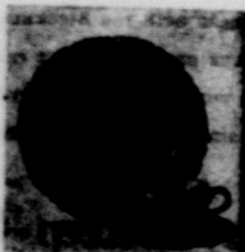
CAPE COD Soft blue, hand-painted Colonial flower forms on contemporary shapes. Simple but sophisticated. 45-P. Set Open Stock $102.10 Special $69.95