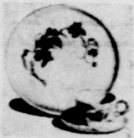
CALIFORNIA IVY 45-P. Set Open Stock $39.50 Special $65.95

SALE! 20% OFF ON ALL OPEN STOCK! famous Poppytrail Dinnerware