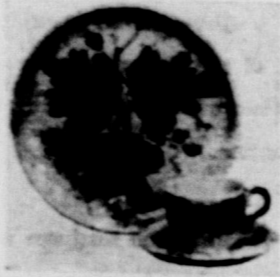
WOODLAND GOLD 45-P. Set Open Stock $92.15 Special $64.95