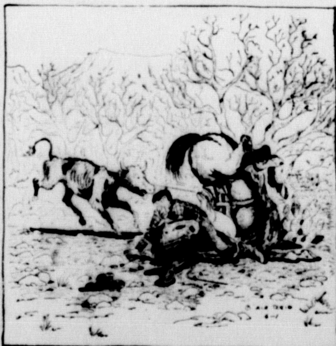
O' hoss, you know a man could shore get hurt adoin' this kind of work.