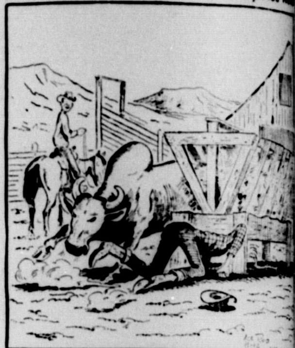
"Oh, what a decision!"