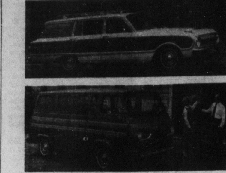
A new addition to the Falcon line for 1962 is this Falcon Squire, (top) a standard, four-door, six-passenger station wagon with simulated wood exterior trim that imparts a custom-crafted look. The Falcon Squire is a "dressed-up" luxury wagon with all the basic advantages of Falcon economy and maneuverability. With the second seat converted, the Squire boasts a big, flat and level cargo space of more than 76 cubic feet. The Deluxe Club Wagon (bottom) is one of three "family fun vehicles" being offered in Ford's Falcon line in 1962. The Deluxe Club Wagon is designed to carry eight passengers, or easily convert into a camping unit, a mobile home on wheels, or an all-around utility vehicle with 204 cubic feet of cargo space. The big double doors swing back to give a side opening of more than 49 inches. This wagon features a deluxe interior with a two-tone pleated vinyl trim scheme carried through seats, doors and side panels.

Van Miller sent the Lions ahead 4 to 0 early on two long set shots but a sticky defense and great rebounding by the Miles crew held