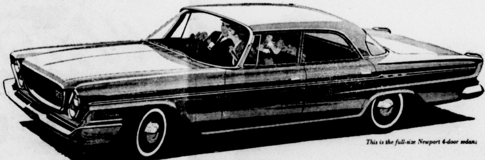
This is the full-size Newport 4-door sedan.