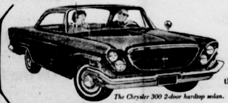
The Chrysler 300 2-door hardtop sedan.

NEWPORT, the full-size Chrysler is still the one to check if you're looking for real value. Newport's the car that helped Chrysler '62 off to a rocketing sales success so far this model year. Newport's beautifully engineered. It sits on a big 122-inch wheelbase. Its suspension holds it steady on curves. Its V-8 engine delivers 265 horsepower on regular gasoline. Newport serves up genuine six-people comfort. Seats are five feet wide. Fabrics are richly textured. Newport surprises people. Because so much car is so modestly priced. *Manufacturer's suggested retail price, exclusive of destination charges. White wall tires extra.