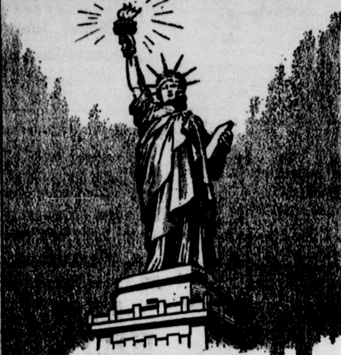
NAME: MOTHER OF EXILES ADDRESS: LIBERTY ISLAND AGE: 75 BIRTHDAY: OCTOBER 28, 1961

"I LIFT MY LAMP BESIDE THE GOLDEN DOOR!"