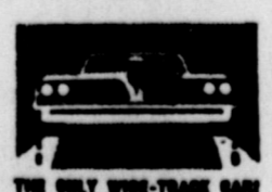
THE ONLY WIDE-TRACK CAR Pontiac has the widest track of any car. Body width trimmed to reduce side overhang. More weight bal- anced between the wheels for extra-quiet driving stability.

We've built more room and greater roadability into this sleek new '61 Pontiac. There's more headroom, legroom and footroom. Doors are wider and they're designed to open farther for greater convenience. By trimming side overhang, we balanced more weight directly between the wheels. The '61 Pontiac gives you greater stability. It gives you a greater sense of control for every mile, every maneuver. Isn't now the time to try the Wide-Track way to travel?