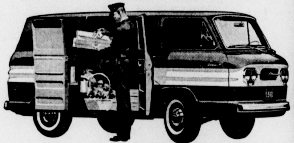
CORVAIR—Side doors open a full 45" wide. Loading height is a low 17"

A panel and two pickups that put a thrifty air-cooled engine in the rear, the driver up front and as much as 1,900 pounds of load space in between! That's more capacity than a conventional half-tonner. Yet these Corvaire 95's are nearly two feet shorter from bumper to bumper. Highly maneuverable. Built to last and bound to save on a busy schedule!