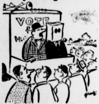
"They're running him as their dark horse candidate."