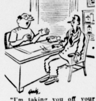
"I'm taking you off your diet."