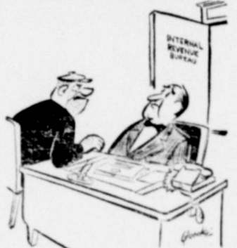
"Do you treat everyone who comes in here like a crook?"