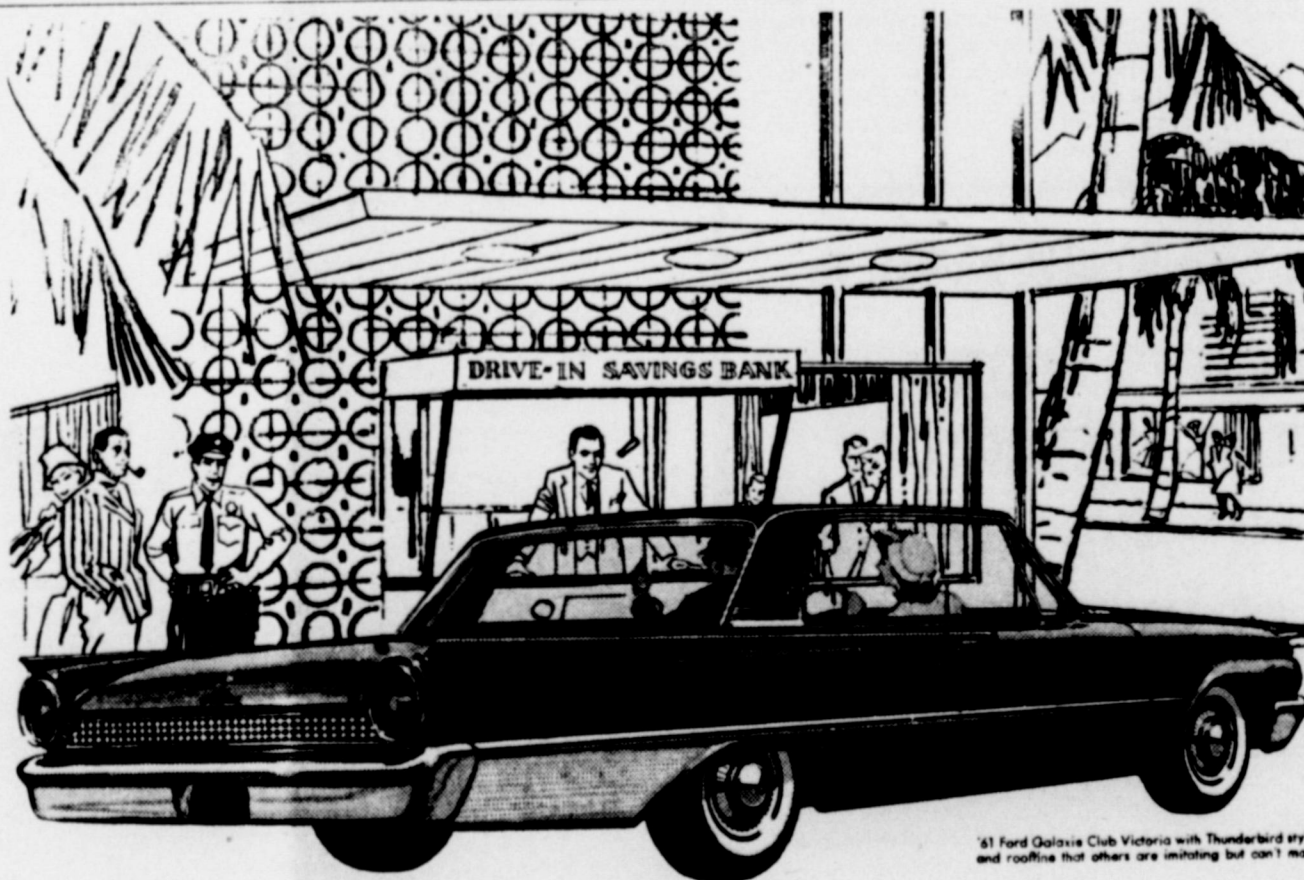
'61 Ford Galaxie Club Victoria with Thunderbird styling and roofline that others are imitating but can't match.