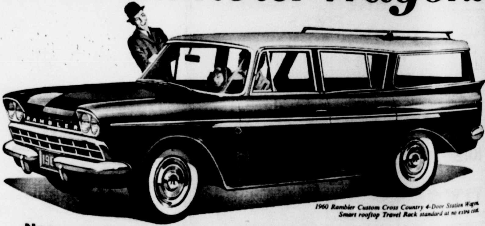
1960 Rambler Custom Cross Country 4-Door Station Wagon. Smart rooftop Travel Rack standard at no extra cost.

Now own Rambler—the world's most popular 6-cylinder wagon—for less than you'd pay for most sedans!