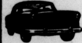
Rambler American Deluxe 2-Door Sedan.

Drive America's Lowest Priced Family Car