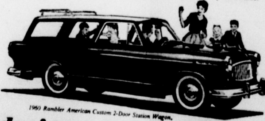
1960 Rambler American Custom 2-Door Station Wagon.

why nobody can match our low, low, low prices. So hurry in while we still have a good choice of smart station wagons. Prices of big used cars are plummeting—waiting may cost you hundreds of dollars. Buy today and save. Get a quality-built Rambler with proved top resale value.