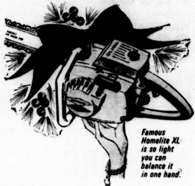
Famous Homelite XL is so light you can balance it in one hand!

Around the home, on the farm, in camp...he'll do any woodcutting job faster and easier with a lightweight, power packed Homelite XL Chain Saw. For cutting firewood or fence posts, trimming trees or clearing land, an easy-to-use Homelite XL is a real time-saver, money-saver, work-saver. So give him the gift he'll want and use all year 'round...give him a Homelite XL—world's fastest selling chain saws!