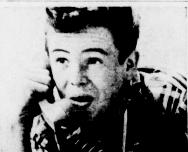
"I'll call you back on my own phone-"

There are some things a fellow needs privacy for. That's when a phone of his own is a boy's best friend! Mom and Dad appreciate that extra phone, too. Additional phones are so inexpensive. Get a handsome additional phone in the color of your choice.