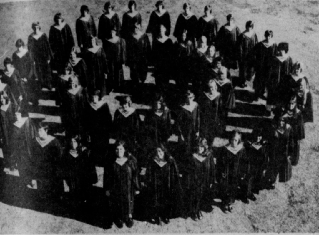
CORN BIBLE ACADEMY CHOIR