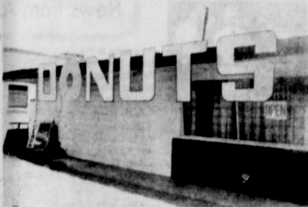
The Donut Shop is McLean's newest business. The shop is located on the east bound lane of I-40. It was formerly The Uplift Cafe. It is operated by the Yarnold family.

Helps Shrink Swelling Of Hemorrhoidal Tissues caused by inflammation Doctors have found a medica- tion that in many cases gives prompt, temporary relief for hours from pain and burning itch in hemorrhoidal tissues, then helps shrink swelling of these tissues caused by inflammation. The name: Preparation H. No prescription is needed. Prepa- ration H. Ointment and sup- positories. Use only as directed.