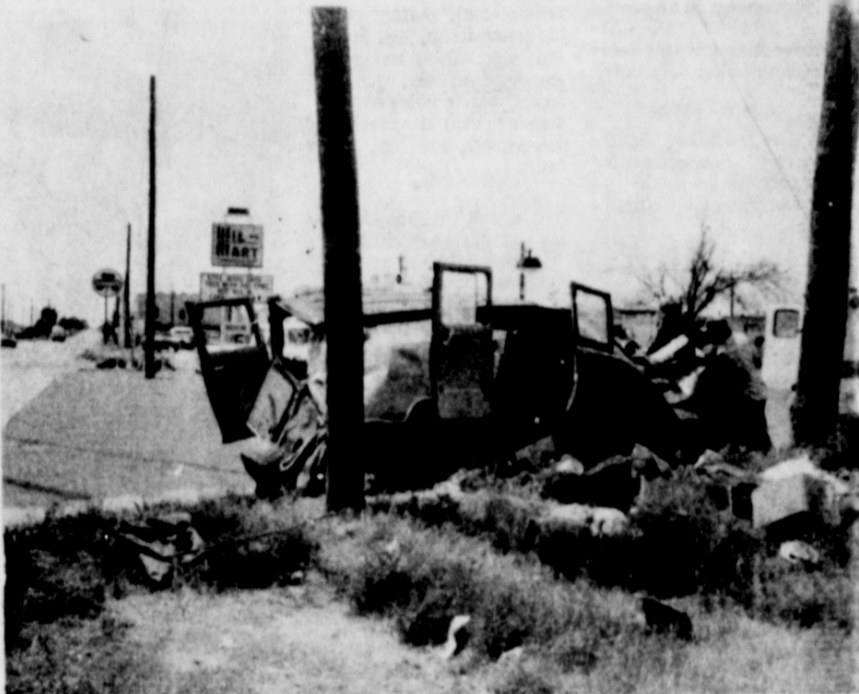
This van was involved in a collision which resulted in one man's death Tuesday afternoon.