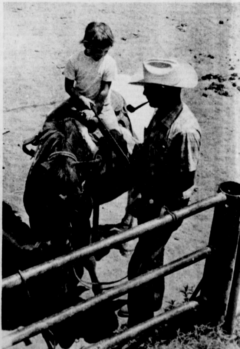
A young contestant awaits his turn in the barrel racing competition during the 4H Playday held last Sunday afternoon.