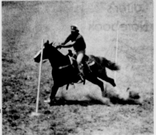
POLE BENDER IN THE SENIOR MEN'S DIVISION