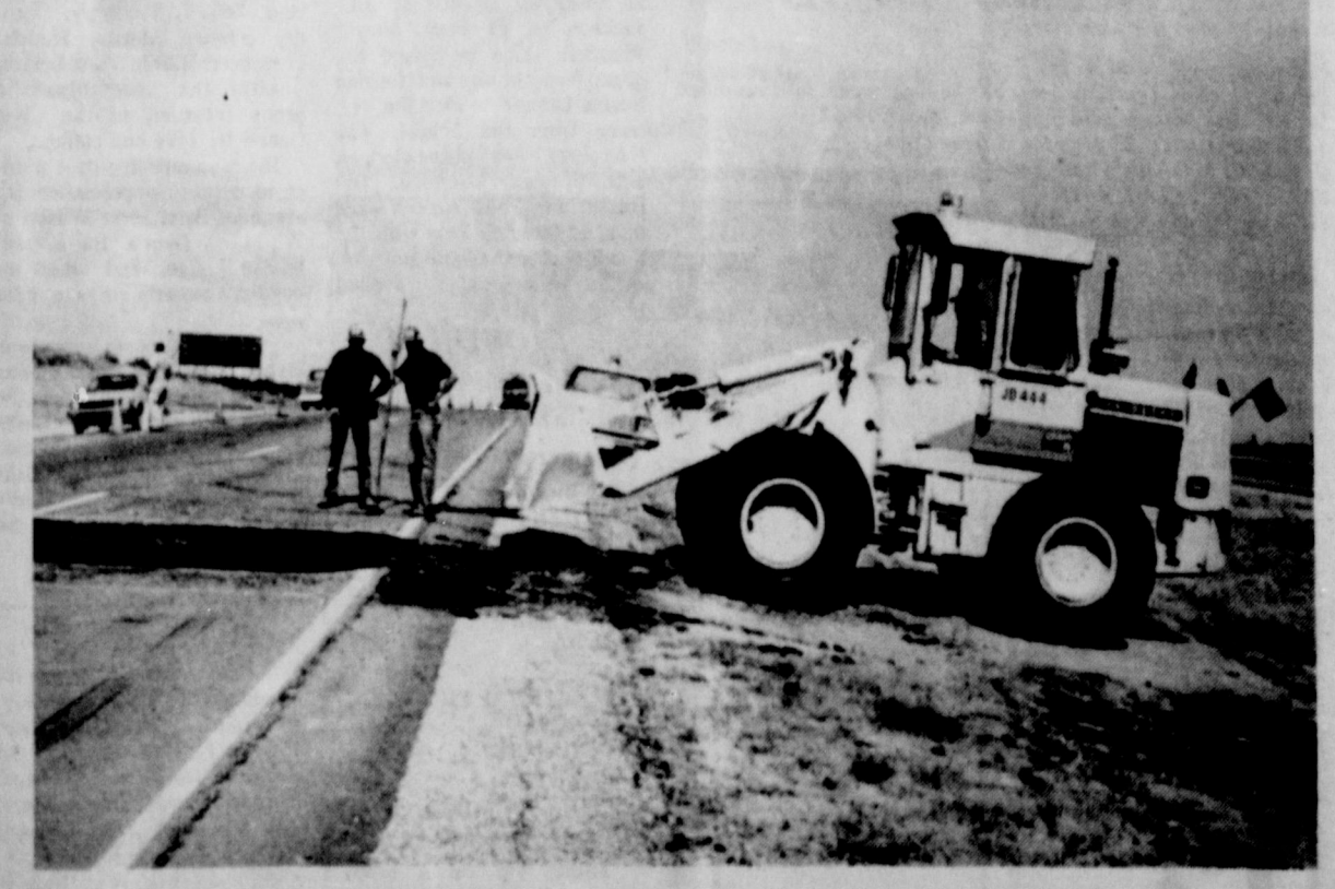
THE HIGH TEMPERATURES in McLean have been dealing the state highway maintenance crews misery. Here, men repair a section of 1-40 east of McLean which exploded because of the heat.