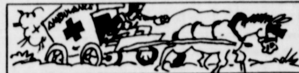
Baron Dominique Jean Larrey, Napoleon's personal surgeon, designed the first ambulance in 1792, and used it in Napoleon's Italian campaign, 1796-7.