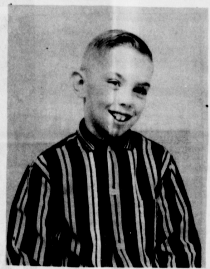
HAPPY BIRTHDAY, THACKO!!!