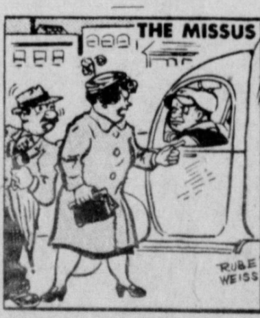
"If I was a man I'd punch you on the nose - and so would my husbandl"

"There you are again," said one, "a brither Scot with his name on the biggest building in London. You canna' keep a guid man doon!'