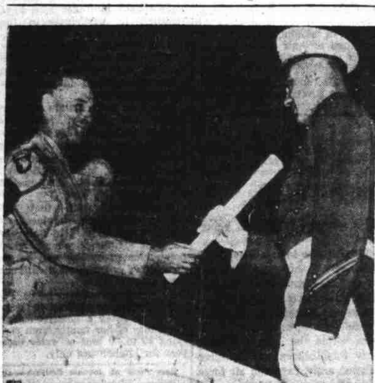
BLANCHARD RECEIVES DIPLOMA—Felix "Doc" Blanchard (right), cadet football star, receives his diploma from General Maxwell D. Taylor, superintendent of the academy, at the graduation exercises at the Military Academy at West Point.