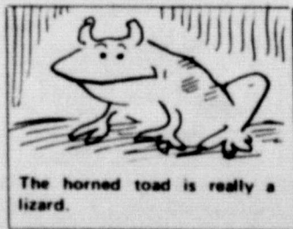
The horned toad is really a lizard.