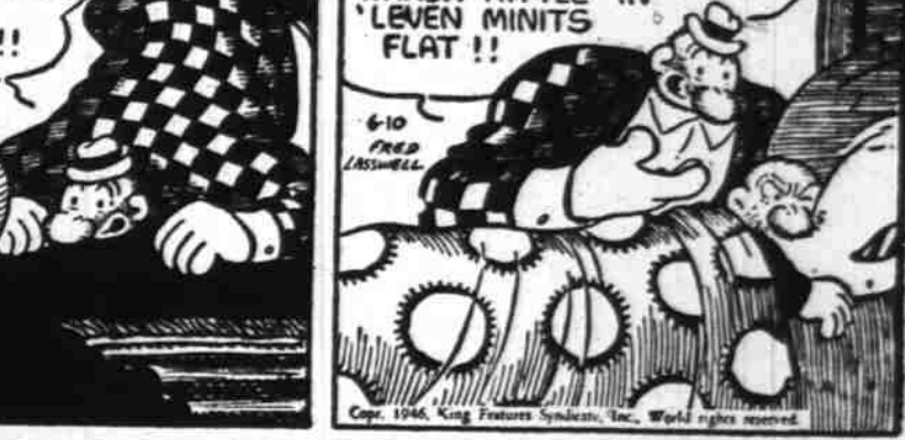
HEY, SNUFFY!! BLUE BLAZES JES' SKEETED FOUR LAPS 'ROUND TH' WASH KITTLE IN 'LEVEN MINITS FLAT!!