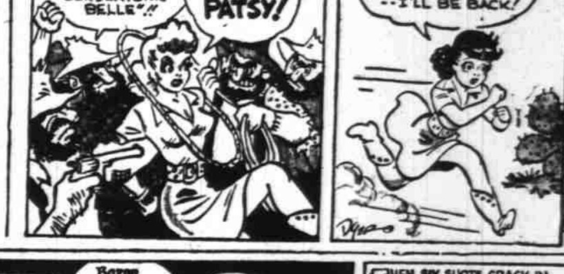
WE'VE GOT CHA' AT LAST... BORDERTOWN'S 'GELLY'!