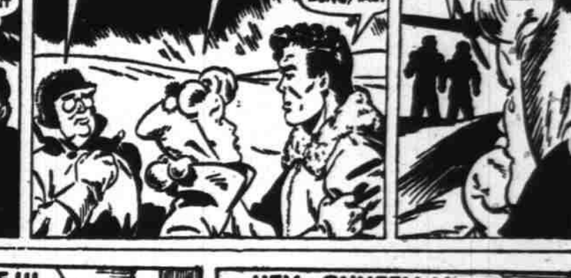
ON YORE MARK, BLUE BLAZES... GIT SOT -- GO!!!