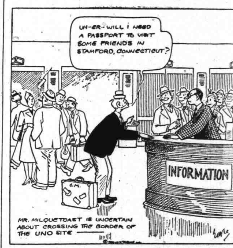
MR. MILQUETDAST IS UNCERTAIN ABOUT CROSSING THE BORDER OF THE UNO SITE