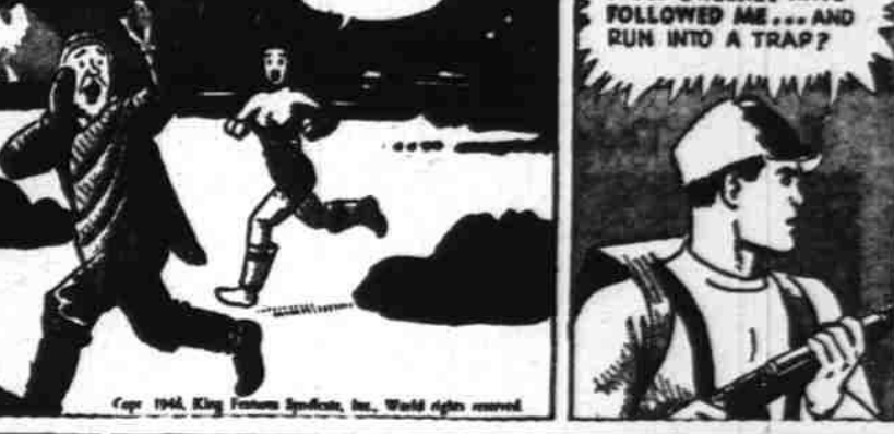
WHILE ONLY AND THE POLICE OF HUNBA-HUNBA ARE COMING FOR THE MISSING NELLIE, SHE HAS FOUND A FRIEND IN A HERMIT OF THE FOREST.