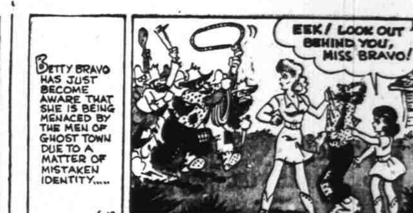
BETTY BRAVO HAS JUST BECOME AWARE THAT SHE IS BEING MENACED BY THE MEN OF GHOST TOWN DUE TO A MATTER OF MISTAKEN IDENTITY....