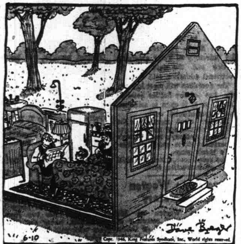
"Gee, Pop, when are we gonna be able to pay the second installment on our pre-fabricated house?"

planes and tanks. An apparent danger is that if and when they are running things they may feel kindly toward that fellow from outside who sympathized with them and not at all kindly toward the fellow who they think ground them down.