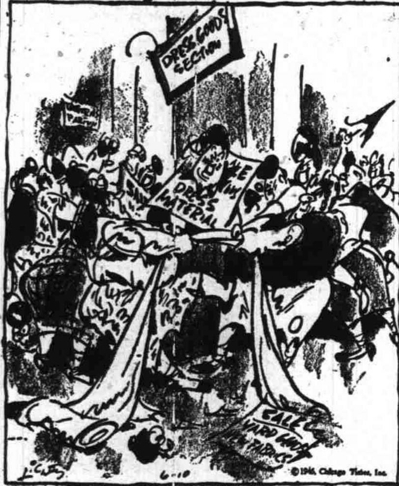
"While you're at it ladies, observe the strength of this wonderful new fabric!"

These people look at the armies that keep the governments in power, and they see tanks and airplanes that came from the USA. They think they are being oppressed and they can't get out from under because of these