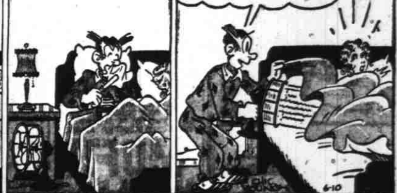
CRACKERS AND PEANUT BUTTER MAKE SUCH A GOOD BEDTIME SNACK