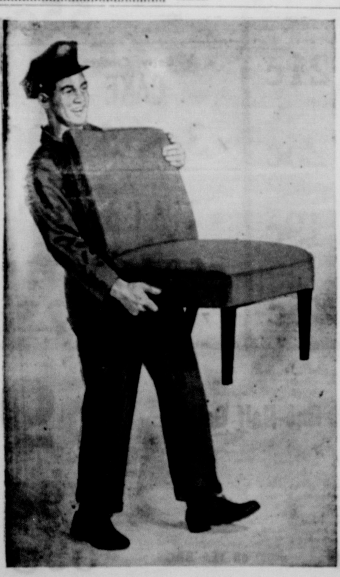
MOVING? THINK OF

HOW TO TREAT IT-Apply strong T-4-L liquid. Feel it take hold to check itching, burning in minutes. In 3 days, watch infected skin slough off. Watch healthy skin replace it. Be pleased IN ONE HOUR or your 48c back. Use antiseptic, soothing T-4-L FOOT POWER too-fine for sweaty feet, oot odor. TODAY at All Drug