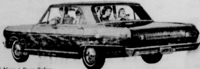
'65 Chevy II Nova 4-Door Sedan

'65 Chevelle Malibu It's smoother, quieter—with V8's available that come on up to 350 hp strong. That's right—350.