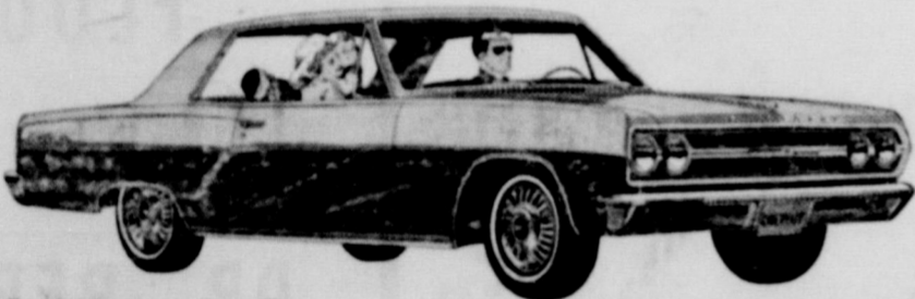
'65 Chevelle Malibu Super Sport Coupe

'65 Chevrolet Impala It's longer, lower, wider—with comforts that'll have many expensive cars feeling a bit envious.