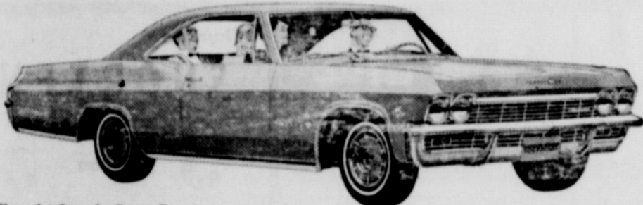
'65 Chevrolet Impala Sport Coupe

So place your order now for delivery on the beautiful new kind of '65 Chevrolet that's right for you!