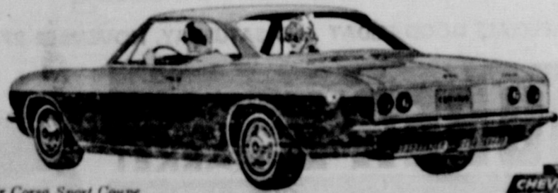
New Corvair Corvair Sport Coupe

'65 Chevy II Nova It's the liveliest, handsomest thing that ever happened to thrift. V8's available with up to 300 hp.