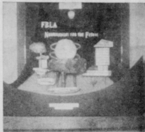
THIRD PLACE: This exhibit of the McLean High School Future Business Leaders of America won third place in national competition last week in Washington, D. C. The exhibit was among 20 from throughout the United States entered in the national FBLA contest.

Donley County commissioners in a meeting recently agreed to furnish right-of-way for the projects announced Wednesday.