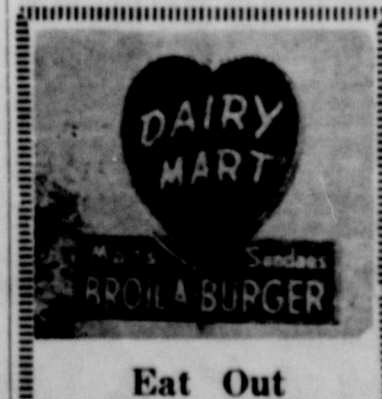
Often at the Dial GR 9-2735