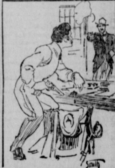
"A Jet of Blood Spurted Out Upon the Table."