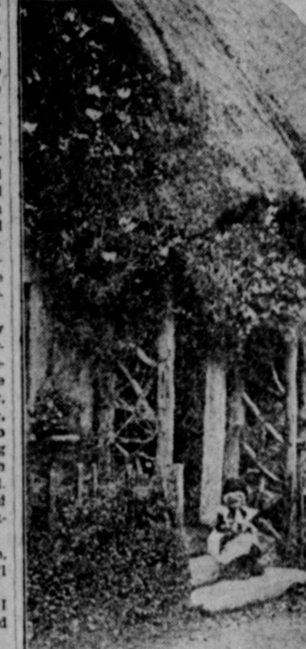
Typical Cottage in Lewis.