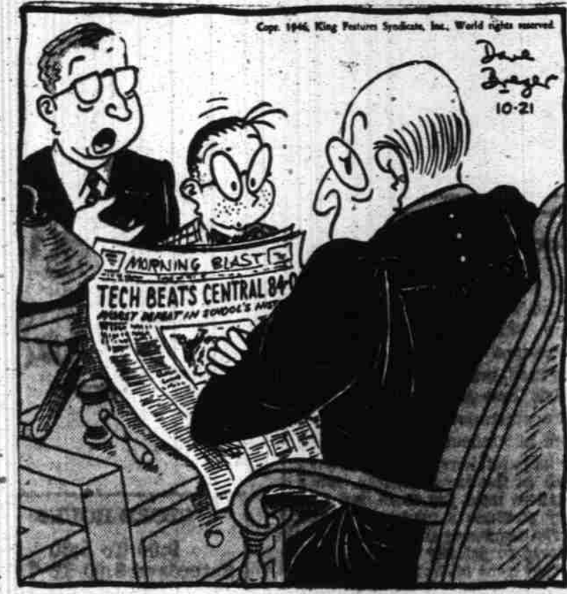
'Knowing your honor to be a distinguished graduate of Central U., the defendant, a Tech man, hesitates to 'hrow himself on the mercy of this court!"