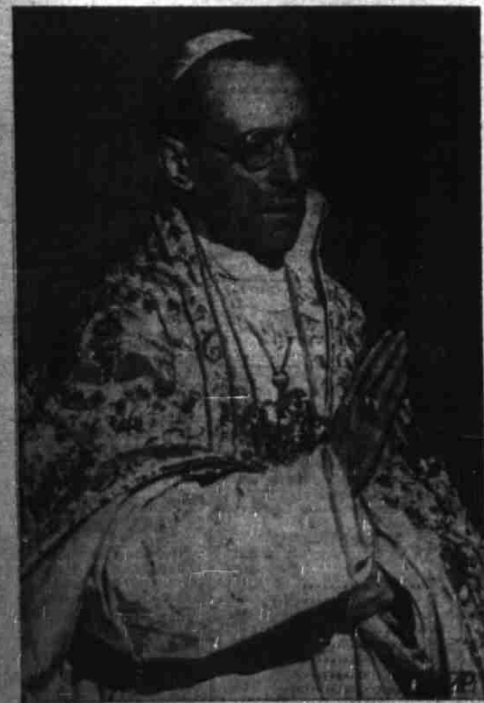
PRINCE OF PEACE the newly crowned Pope Pius XII, 68, looks out upon the multitude that jammed Rome for the holy rituals which elevated him to Roman Catholicism's highest rank. He's the former Cardinal Pacelli.