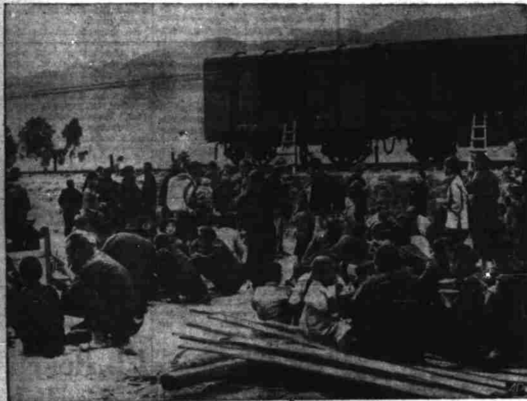
BE IT EVER SO HUMBLE , there's no place like this home for war-driven Chinese refugees near Hongkong. The refugees sleep in the cars, spend their days outdoors.