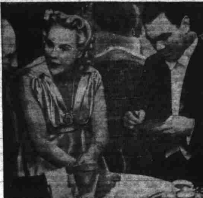
HIS NAME FOR THE ASKING does Max Schmeling inscribe in a Berlin autograph fan's book. His attractive blonde wife, Amy Ondra, is with Maxie, who visited U. S. in February asking for another Joe Louis fight and denying that either he or his wife had been in any difficulty with German authorities. "There's nobody to fight in Europe," he remarked.