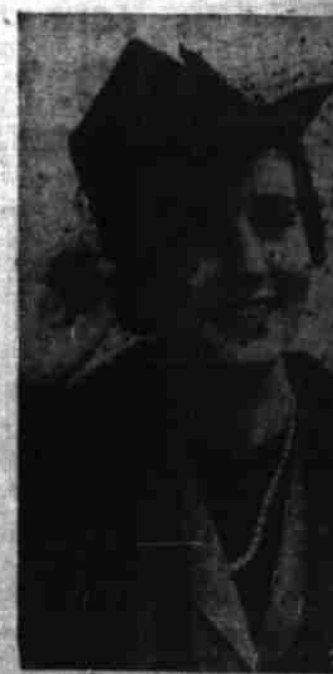
FROM DENMARK comes Crown Princess Ingrid (above) who, with her husband, Crown Prince Frederik, plans a continental tour. She's raised a beauty with a flair for clothes.