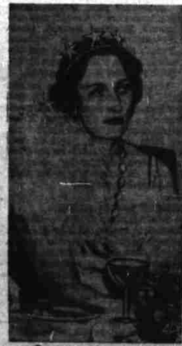
TOUR of Norway's crown princess Martha (above), and her husband, Crown Prince Olaf, in America will be launched by their April visit in home of President Roosevelt.