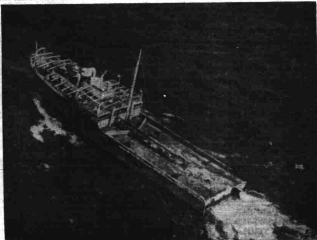
HALF A LOAF (SHIP) IS BETTER THAN NONE applies to the Norwegian freighter, Jaguar, which split in mid-Atlantic. The crew was saved, and stern half towed to Holland.