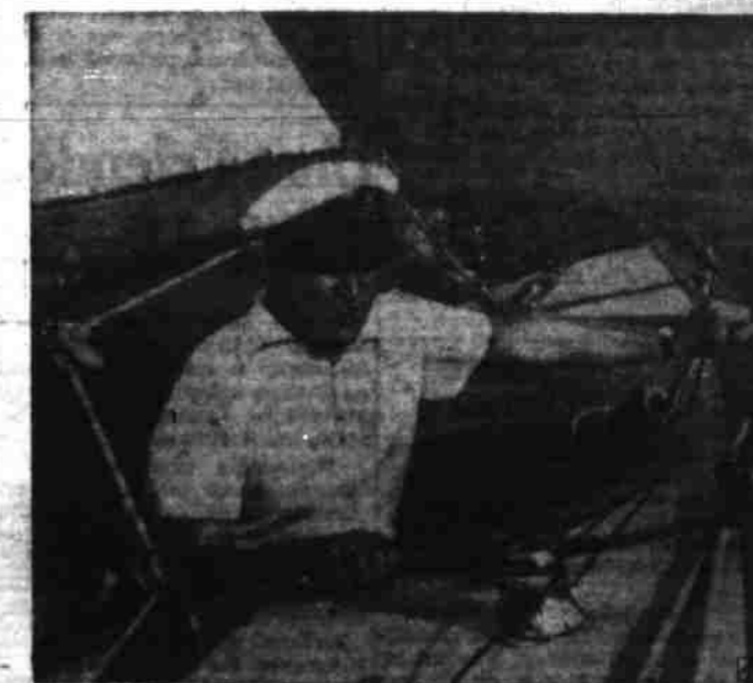
LOVE OF THE SEA will be a common bond when Crown Prince Olaf (above) of Norway and his wife, Crown Princess Martha, visit another sea-lover, Franklin D. Roosevelt. They're to be house guests at Hyde Park.