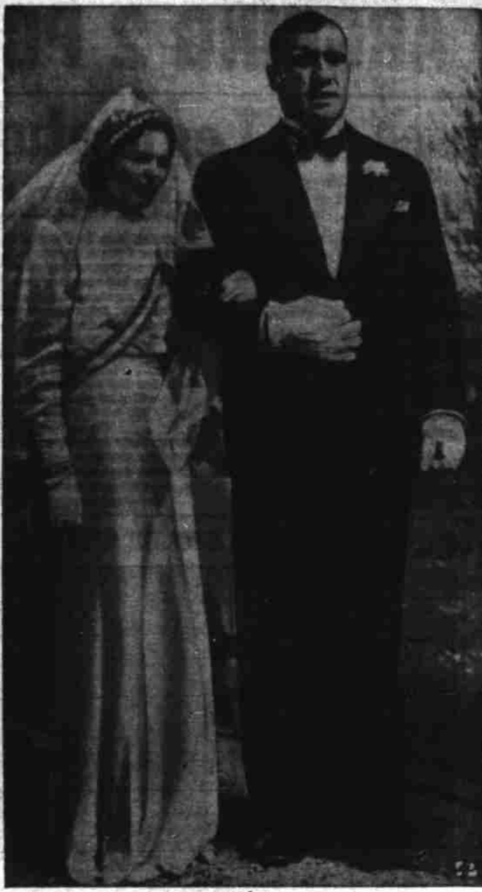
NEW KIND OF GLOVES were worn by ex-heavyweight Champ Primo Carners, who wed Pina Cavanni in Italy.