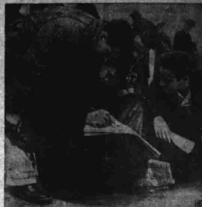
NO WORLD CRISIS could begin to worry these four race track fans as much as do the ponies—in this case, the ponies at Tanforan track in California. And if you think it's not worth to place a bet, look at their tense faces.