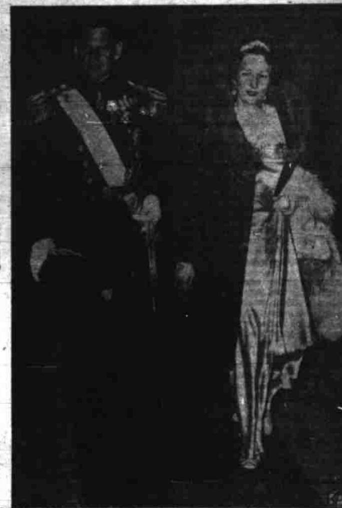
ROAMING ROYALTY scheduled to visit United States this spring and summer includes these representatives from the Scandinavian countries. Crown Prince Frederik of Denmark and Crown Princess Martha of Norway thus met at a party in Stockholm, Sweden, and may meet again on American shores, when they arrive for a tour of cities—and two rival world fairs.