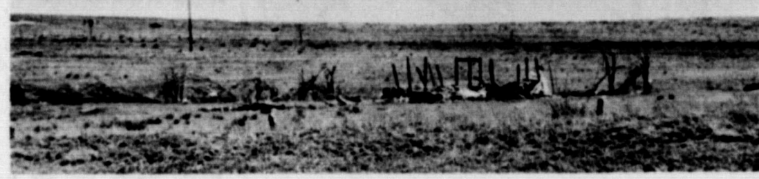
STORM DAMAGE NEAR McLEAN -- The Charles Williams house suffered extensive damage early Saturday morning. The remains of a new barn that was nearly completed. In the third picture the fence and barbed wire is all that remains of the Hulsey Place. This is just a portion of damage suffered by McLean area residents.