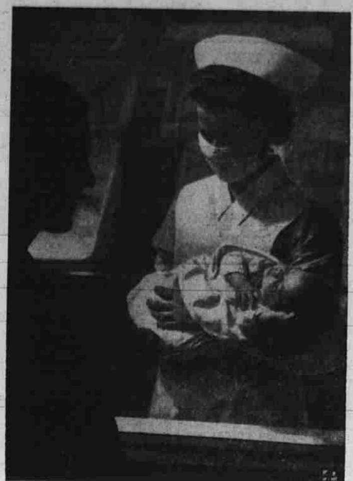
"Till we meet again" . . .