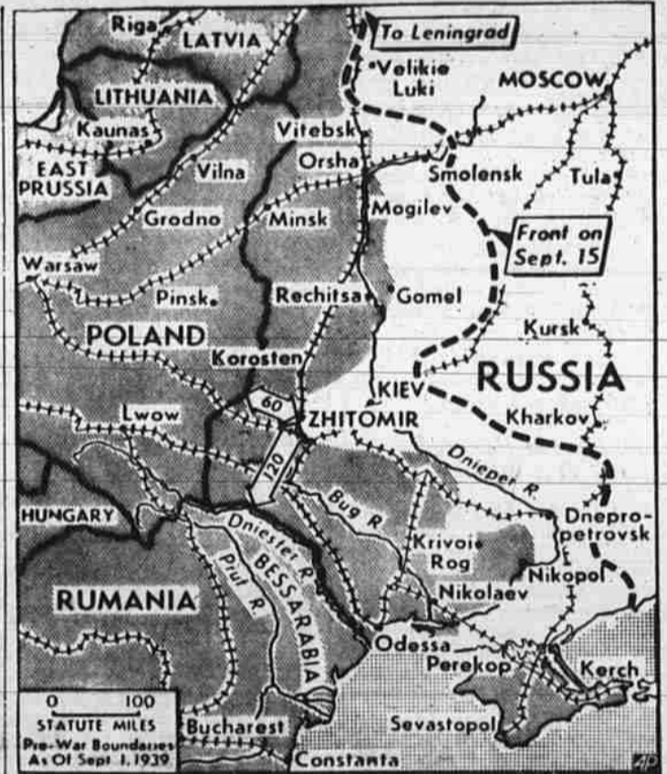
Russians Cut Rail Link—Capture of Zhitomir, announced by Moscow, cut major German rail connection between Odessa and Leningrad.