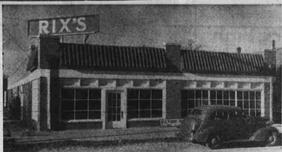
Furniture Home— Buying and selling of used furniture is a specialty of the Rix Furniture company, whose large building at 401 East Second street is pictured above. Lewis B. Rix, operator of the firm, has attained policies to the restrictions of the time, and in addition to handling new lines, maintains a complete stock of used household goods. Rix also is a large buyer of used furniture, and maintains a repair department to put these items in good shape for resale. (Kelsey Photo).