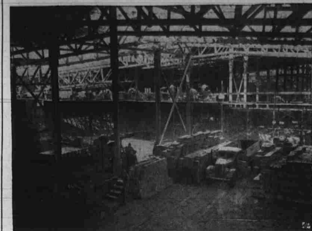
LEND-LEASE WAREHOUSE —Two hundred by 835 feet, this giant warehouse is one of 12 being constructed by Army engineers at Auburn, Wash., to handle lend-lease supplies.

ISTANBUL, Nov. 15 (AP)—Reports emanating from the Balkans said today that the Germans have assumed complete military control of all of Bulgaria's Black sea ports.